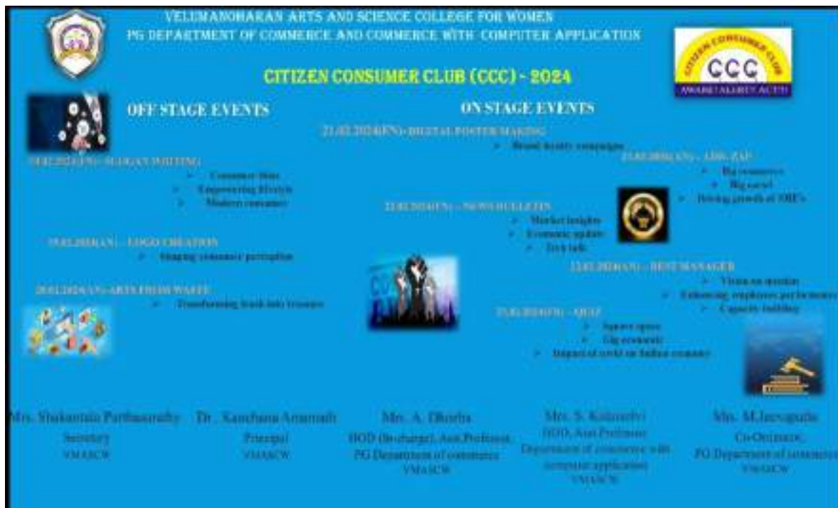
RECAPITULATION OF ACTIVITIES (2023-2024) (PG DEPT. COMMERCE)